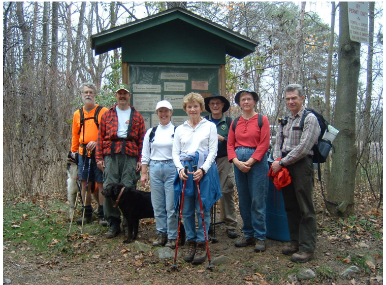
At the Boughton Road entrance to the Park.

Seven hikers and two dogs met at the Beach parking lot at Hundred Acre Pond in Mendon Ponds Park at 9:30 a.m. They hiked to the top of the highest point in the park where the old water tower resides, then south along the ridges, hills and valleys. Taking a different trail back to the parking lot and arriving there at 11:00 a.m., they next ventured to the west side of the pond and scouted out the trails near Clover Street. After a short lunch break, they trekked back to the cars, finishing a great morning of hikes.