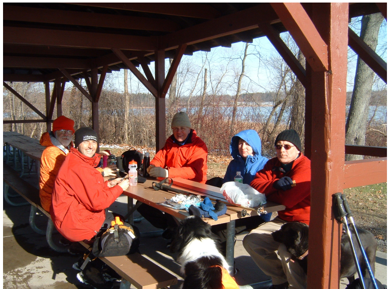
Some of the hikers enjoying the sun as they have lunch near Hundred Acre Pond.