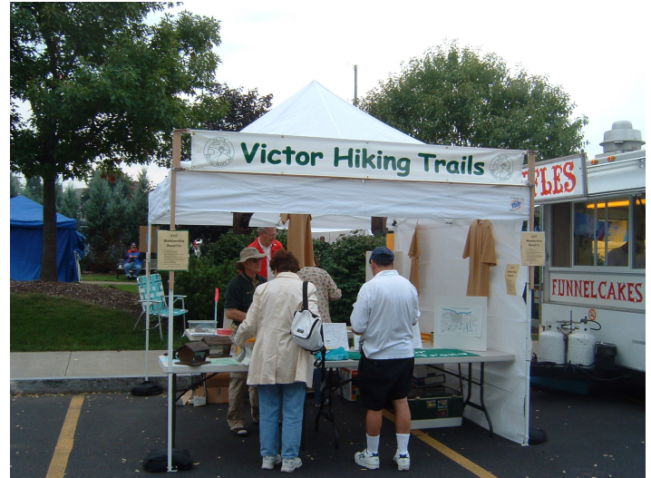
Our booth and new banner at Mead Square Park.

From 5 to 11 p.m. we participated in the first annual Victor Fest. VHT had charge of the desserts. A special thanks to all of the VHT members who baked cookies, brownies, cakes, pies, etc. This was a great fund raiser for VHT. We hope to do it again next year.